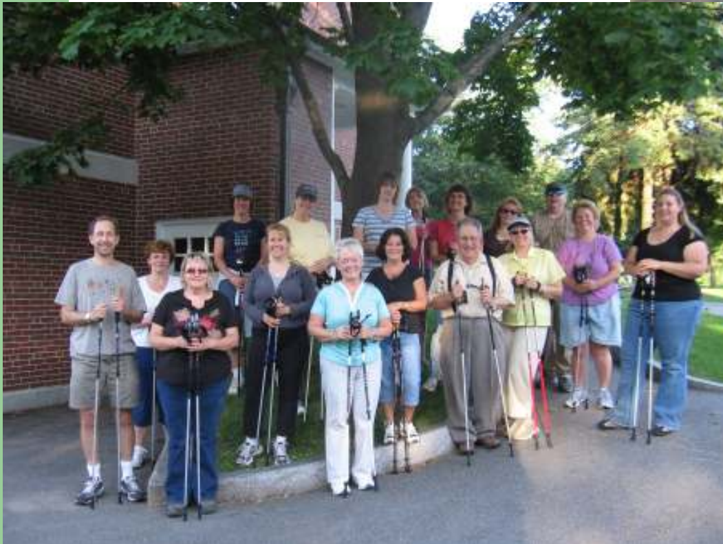
Nordic Walking Group 2009