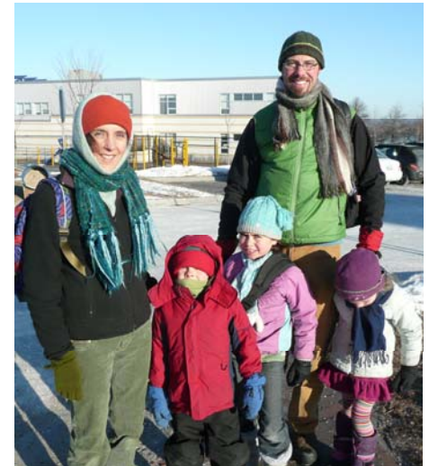
Walking school bus to East End Community School